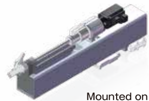
Mounted on single spindle unit