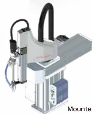
Mounted on screw driving robot

Supports wide range applications from manual fastening to robot.