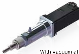
With vacuum attachment