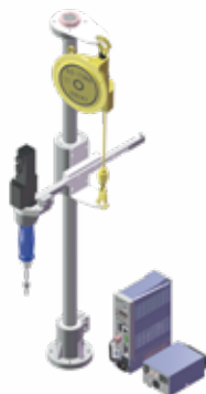
Mounted on arm driver

Supports wide range applications from manual fastening to robot.