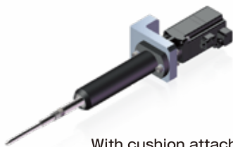
With cushion attachment

F A S T E N I N G I N N O V A T I O N f o r T H E F U T U R E